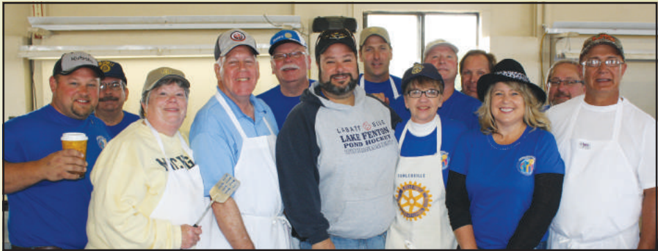
Fowlerville Dawn Patrol