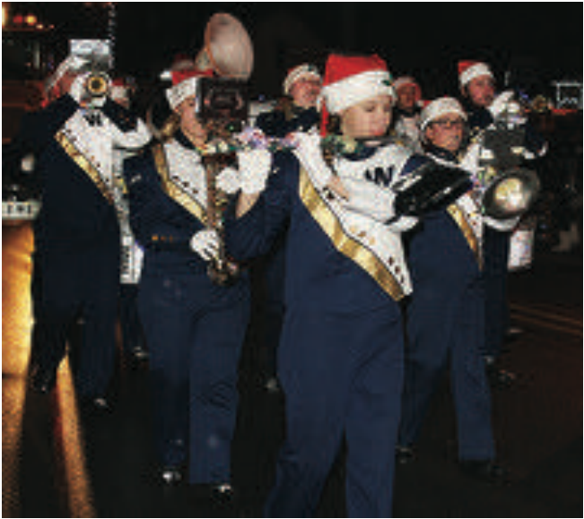
Members of Webberville High School band led the parade.