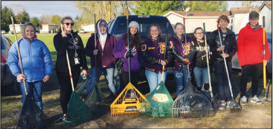
Rotary Interact Club