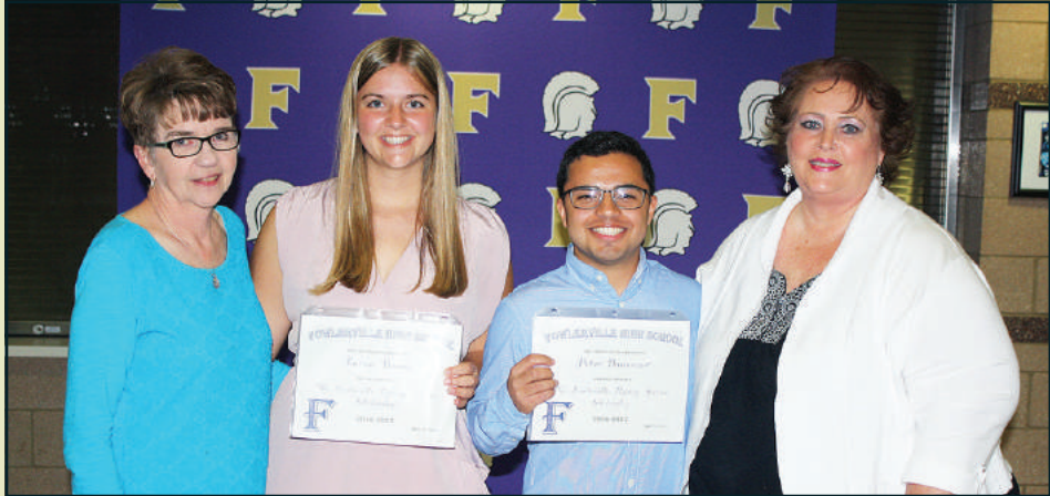
Rotary Service Scholarship Winners