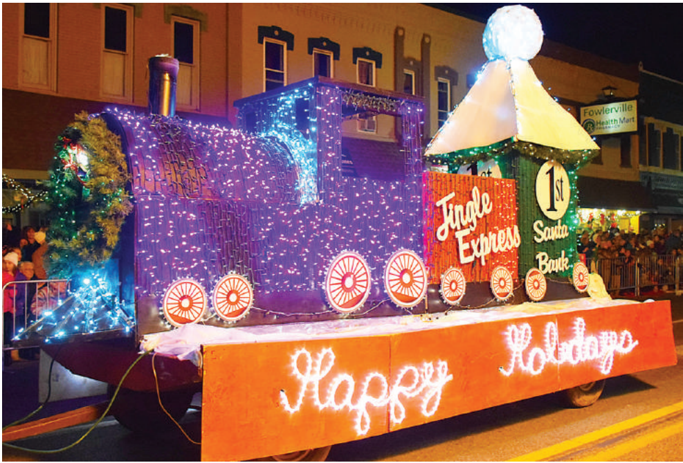
This colorful train from 1st National Bank delighted the crowd as it rolled by.