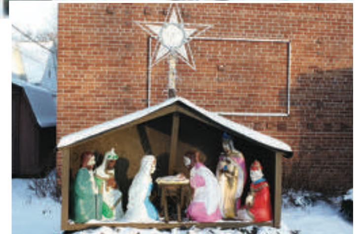
This Nativity graces the western entrance of the church.

English services were introduced in 1903 and by 1906