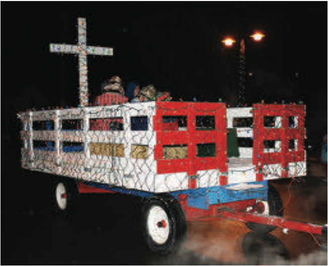
Mt. Hope Church Williamston had this decorated float in the parade.