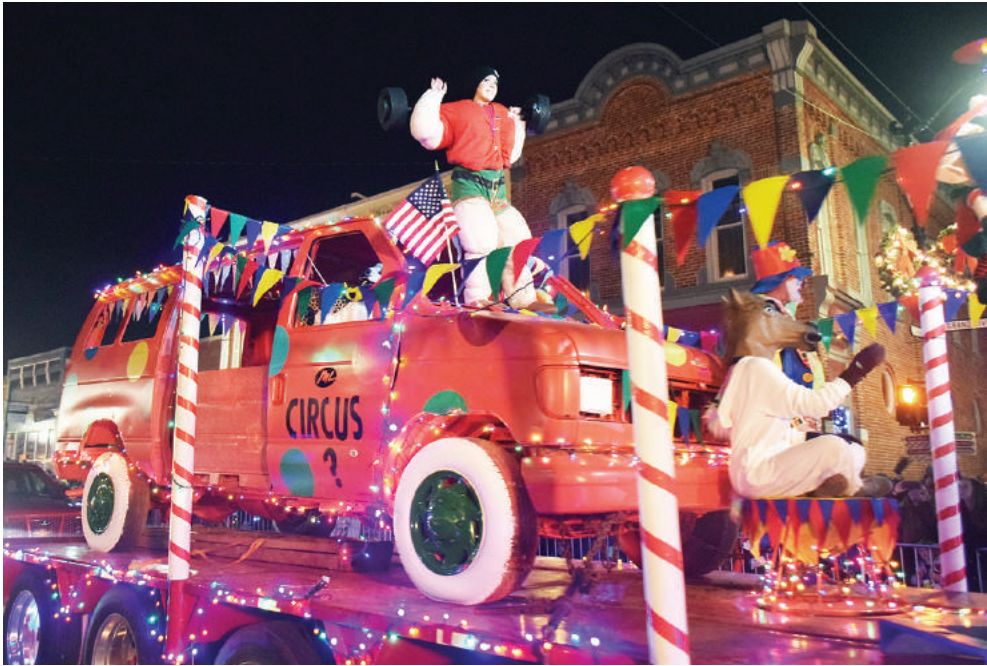
ML Chartier had this bright circus themed float in the Christmas in the Ville parade.